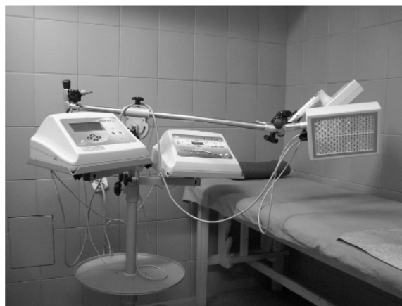
Figure 2 Aparat Viofor JPS Standard to magnetoledtherapy procedures.

The magnetic field intensity amounted to 6. The procedures were performed in outpatient mode, two times a day, daily, for 3 weeks. After each procedure, the wound was dressed in a protective dressing.