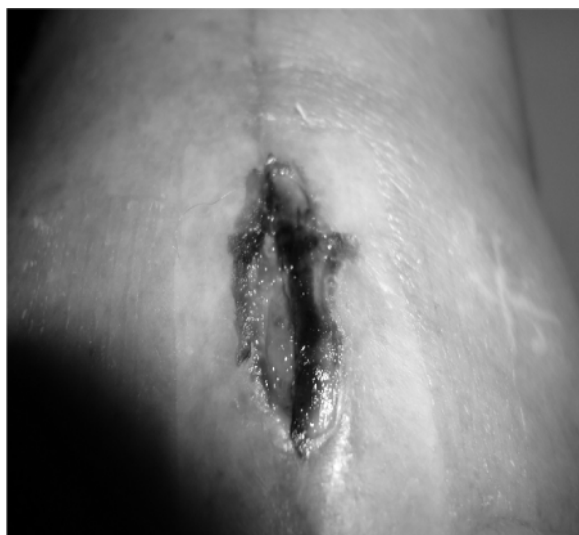
Figure 1 Photograph taken before starting the therapy.

On admission, the patient was found to have a wound in a persistent inflammatory condition and with pus secretion (Figure 1). Also on admission, in addition to the